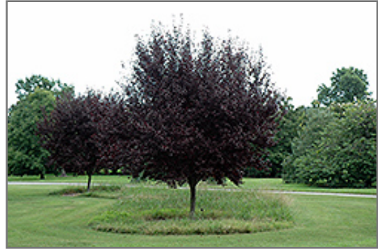
Krauter Vesuvius Plum

Krauter Vesuvius Plum will grow to be about 20 feet tall at maturity, with a spread of 12 feet. It has a low canopy with a typical clearance of 4 feet from the ground, and is suitable for planting under power lines. It grows at a medium rate, and under ideal conditions can be expected to live for approximately 30 years.