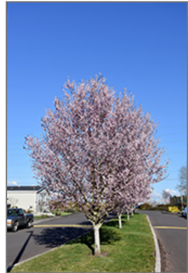
Krauter Vesuvius Plum in bloom

This tree will require occasional maintenance and upkeep, and is best pruned in late winter once the threat of extreme cold has passed. It is a good choice for attracting birds to your yard. Gardeners should be aware of the following characteristic(s) that may warrant special consideration;