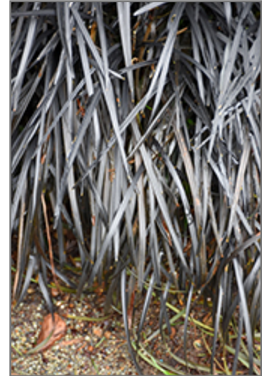
Black Mondo Grass foliage

Black Mondo Grass is a fine choice for the garden, but it is also a good selection for planting in outdoor pots and containers. It is often used as a 'filler' in the 'spiller-thriller-filler' container combination, providing a mass of flowers and foliage against which the thriller plants stand out. Note that when growing plants in outdoor containers and baskets, they may require more frequent waterings than they would in the yard or garden.