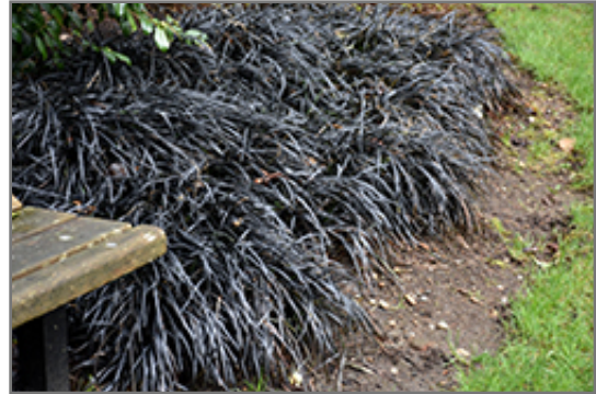
Black Mondo Grass

Black Mondo Grass is recommended for the following landscape applications;