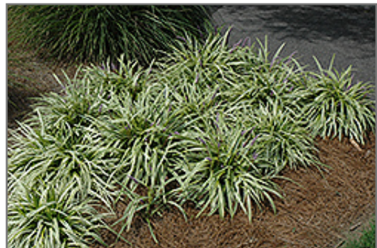
Variegata Lily Turf in bloom