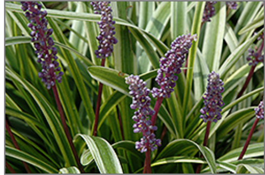
Variegata Lily Turf flowers

Variegata Lily Turf is recommended for the following landscape applications;