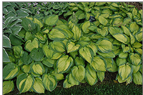
Paradigm Hosta