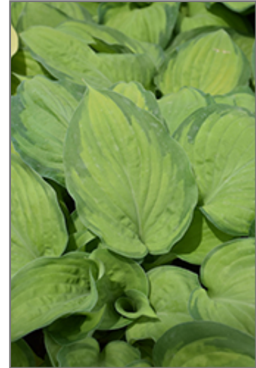
Paradigm Hosta foliage

Paradigm Hosta will grow to be about 10 inches tall at maturity extending to 18 inches tall with the flowers, with a spread of 4 feet. When grown in masses or used as a bedding plant, individual plants should be spaced approximately 4 feet apart. Its foliage tends to remain low and dense right to the ground. It grows at a medium rate, and under ideal conditions can be expected to live for approximately 10 years. As an herbaceous perennial, this plant will usually die back to the crown each winter, and will regrow from the base each spring. Be careful not to disturb the crown in late winter when it may not be readily seen!