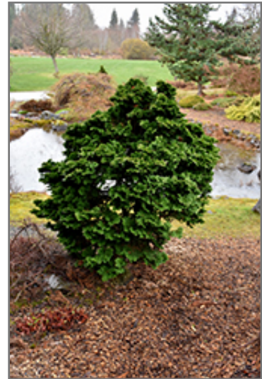
Dwarf Hinoki Falsecypress