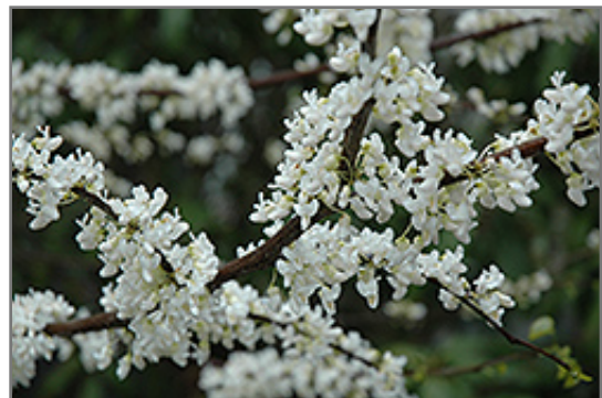
White Redbud flowers