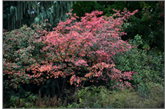
Autumn Brilliance Serviceberry in fall

This tree does best in full sun to partial shade. It prefers to grow in average to moist conditions, and shouldn't be allowed to dry out. It is not particular as to soil type or pH. It is somewhat tolerant of urban pollution. This particular variety is an interspecific hybrid.