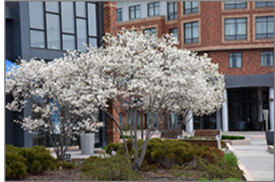
Autumn Brilliance Serviceberry in bloom

Autumn Brilliance Serviceberry is recommended for the following landscape applications;