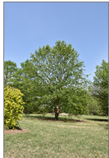
Dura Heat River Birch

Ann Arbor 734-332-7900 155 N. Maple at Jackson