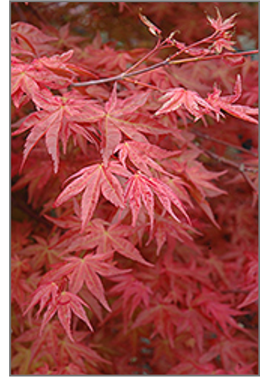
Suminagashi Japanese Maple foliage

This tree does best in full sun to partial shade. It prefers to grow in average to moist conditions, and shouldn't be allowed to dry out. It is not particular as to soil pH, but grows best in rich soils. It is somewhat tolerant of urban pollution, and will benefit from being planted in a relatively sheltered location. Consider applying a thick mulch around the root zone in winter to protect it in exposed locations or colder microclimates. This is a selected variety of a species not originally from North America.