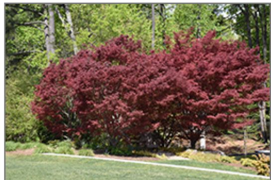
Suminagashi Japanese Maple