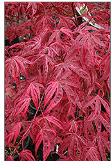
Shirazz Japanese Maple foliage