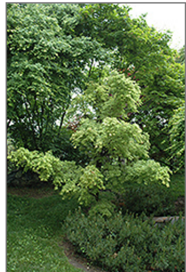
Higasa Yama Japanese Maple