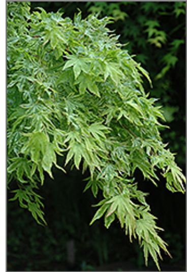
Higasa Yama Japanese Maple foliage