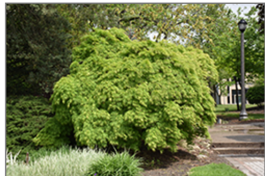
Cutleaf Japanese Maple

Ann Arbor 734-332-7900 155 N. Maple at Jackson