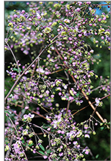
Rochebrun Meadow Rue flowers