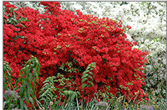
Stewartstonian Azalea in bloom