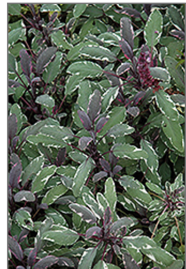
Tricolor Sage foliage