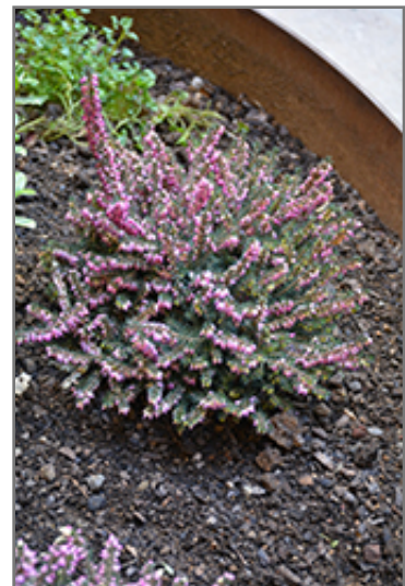
Mediterranean Pink Heath in bloom

Ann Arbor 734-332-7900 155 N. Maple at Jackson