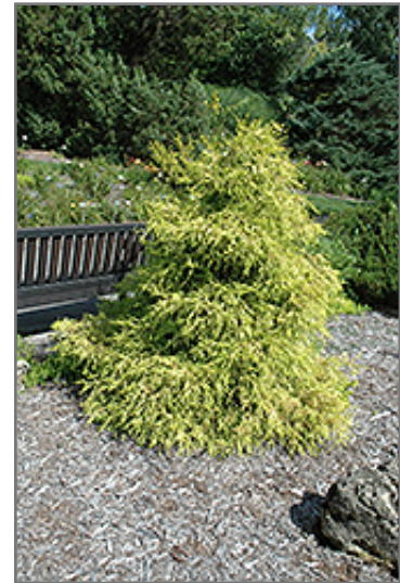
Lemon Thread Falsecypress

Lemon Thread Falsecypress is recommended for the following landscape applications;