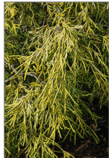
Lemon Thread Falsecypress foliage