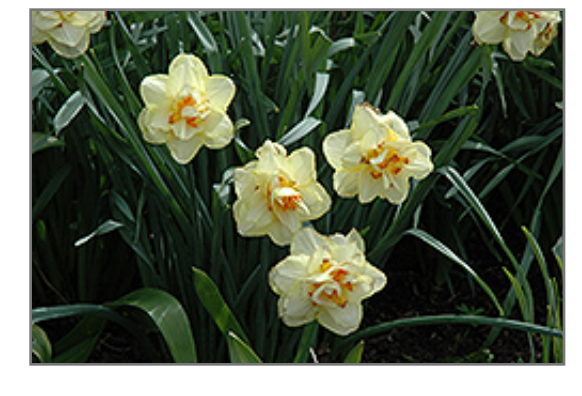
Manly Daffodil flowers