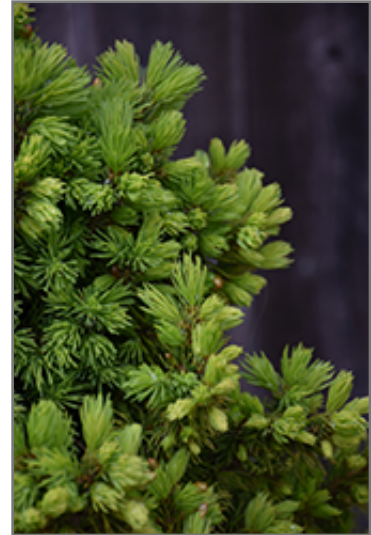
Rainbow's End Spruce foliage

This shrub should only be grown in full sunlight. It prefers to grow in average to moist conditions, and shouldn't be allowed to dry out. It is not particular as to soil type or pH. It is somewhat tolerant of urban pollution, and will benefit from being planted in a relatively sheltered location. This is a selection of a native North American species.