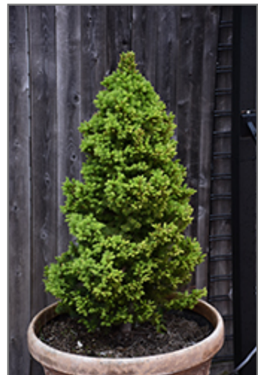
Rainbow's End Spruce

Ann Arbor 734-332-7900 155 N. Maple at Jackson