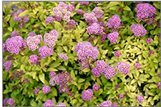
Sundrop Spirea flowers

Sundrop Spirea is recommended for the following landscape applications;