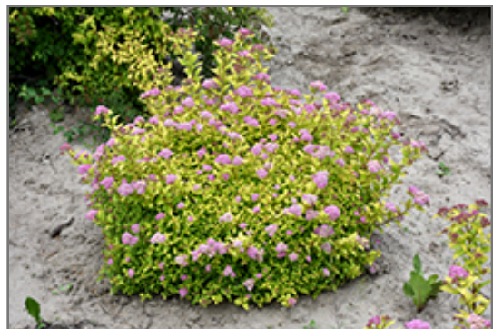
Sundrop Spirea in bloom