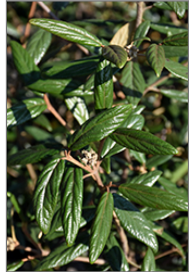
Prague Viburnum foliage

This shrub does best in full sun to partial shade. It prefers to grow in average to moist conditions, and shouldn't be allowed to dry out. It is not particular as to soil type or pH. It is highly tolerant of urban pollution and will even thrive in inner city environments. This particular variety is an interspecific hybrid.