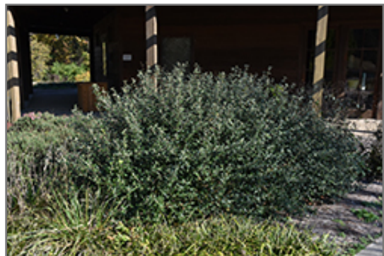
Prague Viburnum