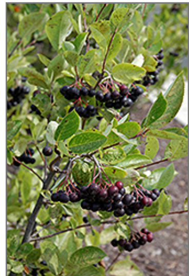
Iroquois Beauty Black Chokeberry fruit