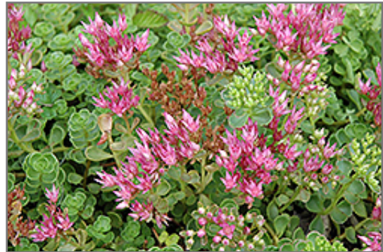
John Creech Stonecrop flowers

John Creech Stonecrop is recommended for the following landscape applications;