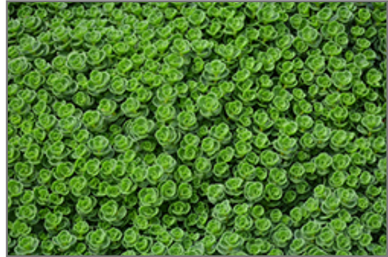
John Creech Stonecrop foliage

John Creech Stonecrop will grow to be only 3 inches tall at maturity, with a spread of 12 inches. When grown in masses or used as a bedding plant, individual plants should be spaced approximately 10 inches apart. Its foliage tends to remain low and dense right to the ground. It grows at a fast rate, and under ideal conditions can be expected to live for approximately 10 years. As an herbaceous perennial, this plant will usually die back to the crown each winter, and will regrow from the base each spring. Be careful not to disturb the crown in late winter when it may not be readily seen!