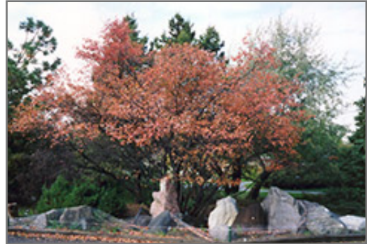
Allegheny Serviceberry in fall

This tree does best in full sun to partial shade. It prefers to grow in average to moist conditions, and shouldn't be allowed to dry out. It is not particular as to soil type or pH. It is somewhat tolerant of urban pollution. This species is native to parts of North America.