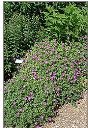
Max Frei Cranesbill in bloom