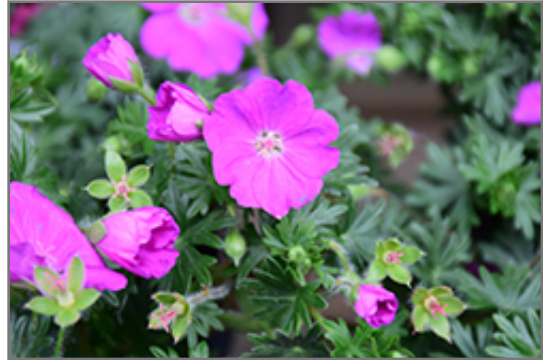
Max Frei Cranesbill flowers