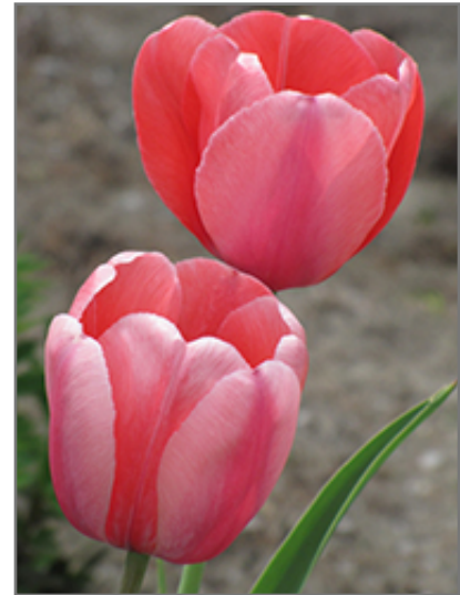
Pink Impression Tulip flowers