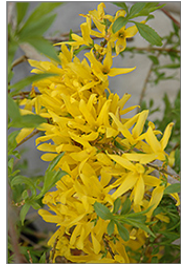
Gold Tide Forsythia flowers

Gold Tide Forsythia is recommended for the following landscape applications;