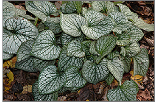
Jack Frost Bugloss