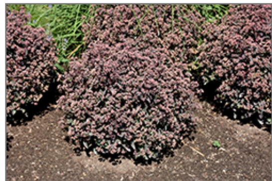
Rock 'N Grow Tiramisu Stonecrop in bloom