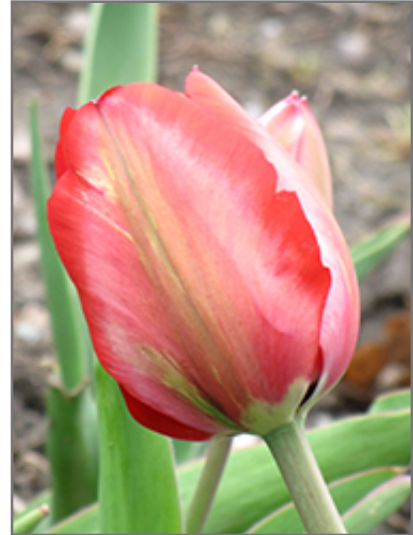
Menton Tulip flowers