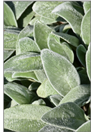
Lamb's Ears foliage

Lamb's Ears is recommended for the following landscape applications;