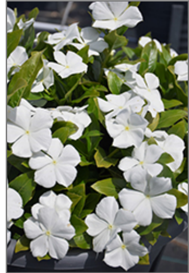
Cora Cascade White Vinca flowers

Cora Cascade White Vinca is recommended for the following landscape applications;