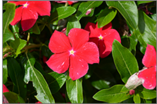
Cora XDR Red Vinca flowers

Cora XDR Red Vinca is recommended for the following landscape applications;