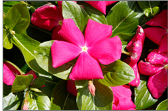
Cora Cascade Bright Rose Vinca flowers

This plant will require occasional maintenance and upkeep, and should not require much pruning, except when necessary, such as to remove dieback. It is a good choice for attracting butterflies to your yard, but is not particularly attractive to deer who tend to leave it alone in favor of tastier treats. It has no significant negative characteristics.