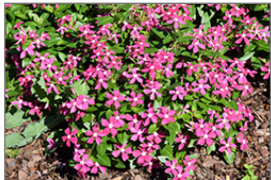
Soiree Kawaii Red Vinca in bloom

Ann Arbor 734-332-7900 155 N. Maple at Jackson