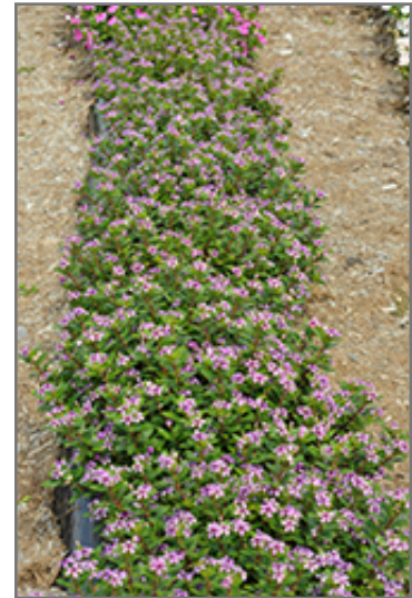
Soiree Kawaii Blueberry Kiss Vinca in bloom

Soiree Kawaii Blueberry Kiss Vinca is a fine choice for the garden, but it is also a good selection for planting in outdoor containers and hanging baskets. Because of its trailing habit of growth, it is ideally suited for use as a 'spiller' in the 'spiller-thriller-filler' container combination; plant it near the edges where it can spill gracefully over the pot. Note that when growing plants in outdoor containers and baskets, they may require more frequent waterings than they would in the yard or garden.