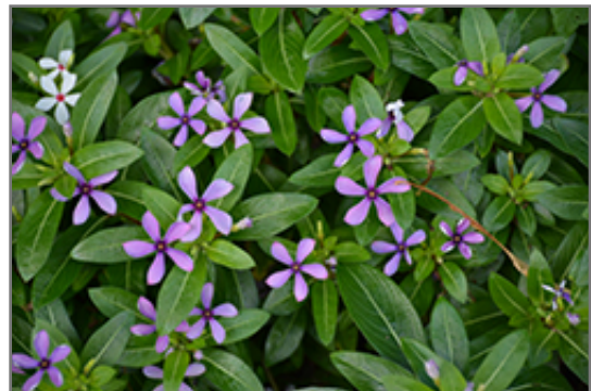
Soiree Kawaii Blueberry Kiss Vinca flowers