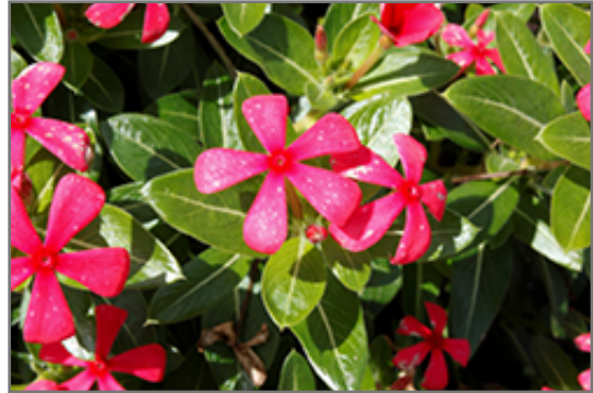
Soiree Kawaii Red Shades Vinca flowers

Soiree Kawaii Red Shades Vinca is a dense herbaceous annual with a trailing habit of growth, eventually spilling over the edges of hanging baskets and containers. Its medium texture blends into the garden, but can always be balanced by a couple of finer or coarser plants for an effective composition.