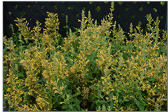
Kudos Yellow Hyssop flowers

Kudos Yellow Hyssop is recommended for the following landscape applications;