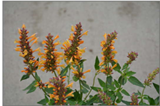
Kudos Gold Hyssop flowers