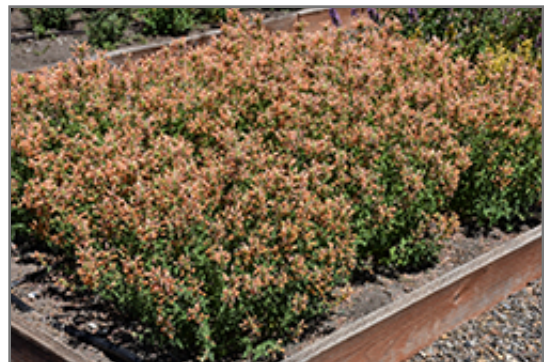
Kudos Gold Hyssop in bloom

Ann Arbor 734-332-7900 155 N. Maple at Jackson