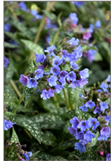
Trevi Fountain Lungwort flowers