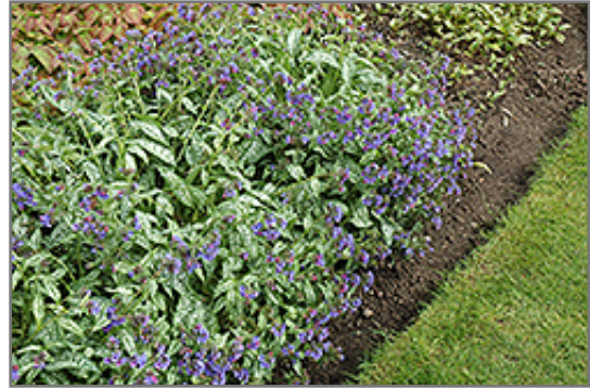
Trevi Fountain Lungwort in bloom

Trevi Fountain Lungwort will grow to be about 12 inches tall at maturity, with a spread of 18 inches. When grown in masses or used as a bedding plant, individual plants should be spaced approximately 15 inches apart. Its foliage tends to remain dense right to the ground, not requiring facer plants in front. It grows at a medium rate, and under ideal conditions can be expected to live for approximately 10 years. As an herbaceous perennial, this plant will usually die back to the crown each winter, and will regrow from the base each spring. Be careful not to disturb the crown in late winter when it may not be readily seen!