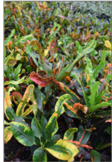
Mammy Croton in full

This is a dense herbaceous evergreen houseplant with an upright spreading habit of growth. Its wonderfully bold, coarse texture is quite ornamental and should be used to full effect. This plant should not require much pruning, except when necessary to keep it looking its best.