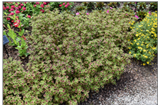
ColorBlaze Chocolate Drop Coleus

Ann Arbor 734-332-7900 155 N. Maple at Jackson