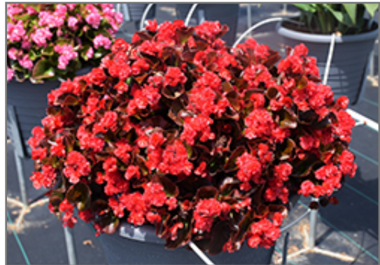
Double Up Red Begonia in bloom