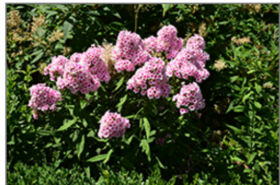
Bright Eyes Garden Phlox in bloom