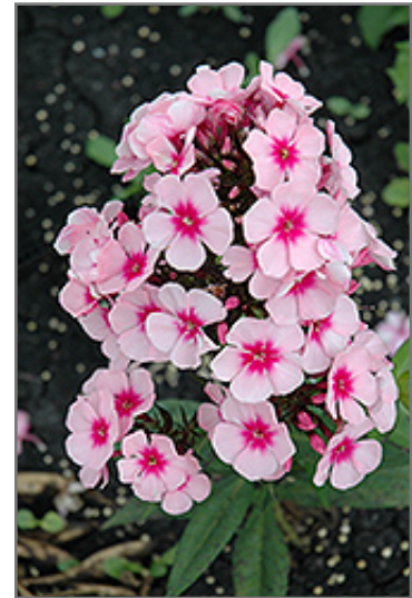
Bright Eyes Garden Phlox flowers

Bright Eyes Garden Phlox is a fine choice for the garden, but it is also a good selection for planting in outdoor pots and containers. With its upright habit of growth, it is best suited for use as a 'thriller' in the 'spiller-thriller-filler' container combination; plant it near the center of the pot, surrounded by smaller plants and those that spill over the edges. It is even sizeable enough that it can be grown alone in a suitable container. Note that when growing plants in outdoor containers and baskets, they may require more frequent waterings than they would in the yard or garden.