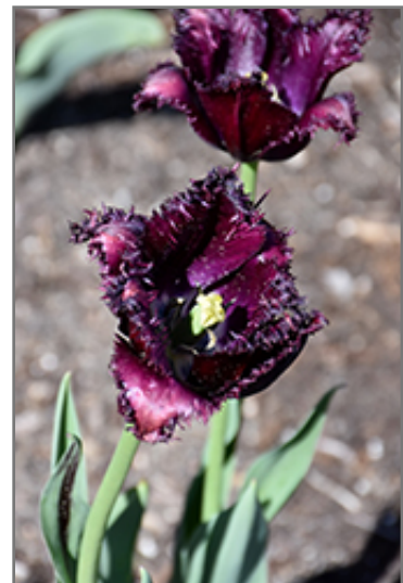
Black Parrot Tulip flowers