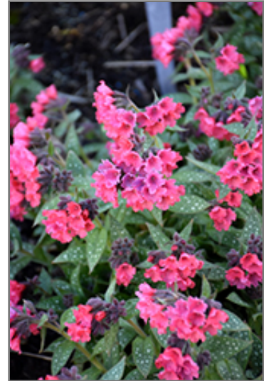
Shrimps On The Barbie Lungwort flowers

This is a relatively low maintenance plant, and should be cut back in late fall in preparation for winter. It is a good choice for attracting bees, butterflies and hummingbirds to your yard, but is not particularly attractive to deer who tend to leave it alone in favor of tastier treats. It has no significant negative characteristics.