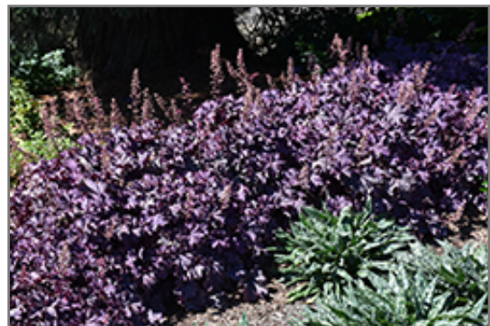
Grande Amethyst Coral Bells in bloom