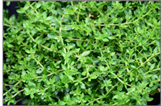
Rupturewort foliage