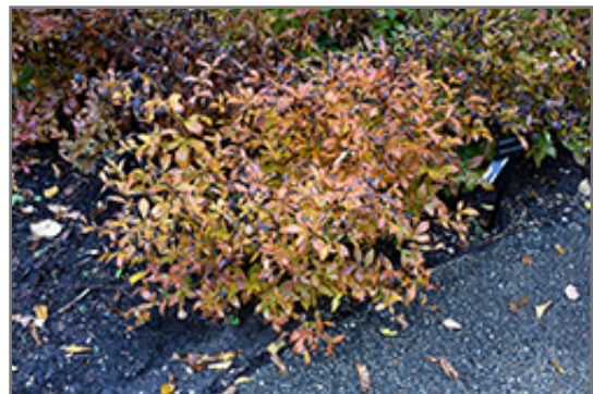
Bowman's Root in fall

Ann Arbor 734-332-7900 155 N. Maple at Jackson