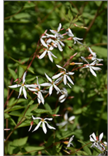
Bowman's Root flowers

This plant will require occasional maintenance and upkeep, and should be cut back in late fall in preparation for winter. It is a good choice for attracting bees and butterflies to your yard. It has no significant negative characteristics.