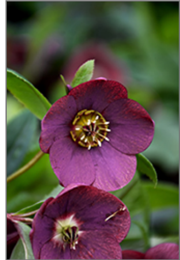
Honeymoon Rome In Red Hellebore flowers

Honeymoon Rome In Red Hellebore is recommended for the following landscape applications;